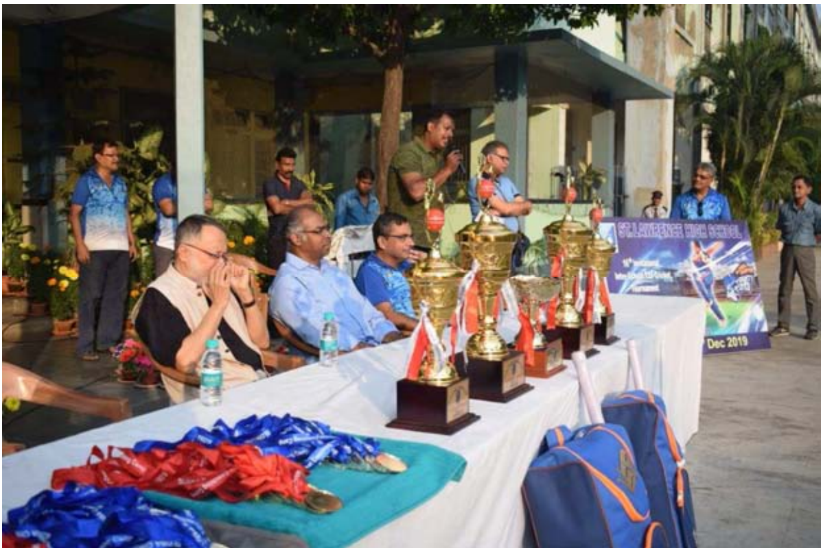
SLOBA Inter School Cricket Tournament 2019