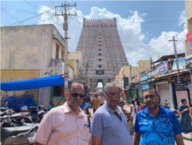
JAAI National Conference 2020 Temple Town Tiruchirappally