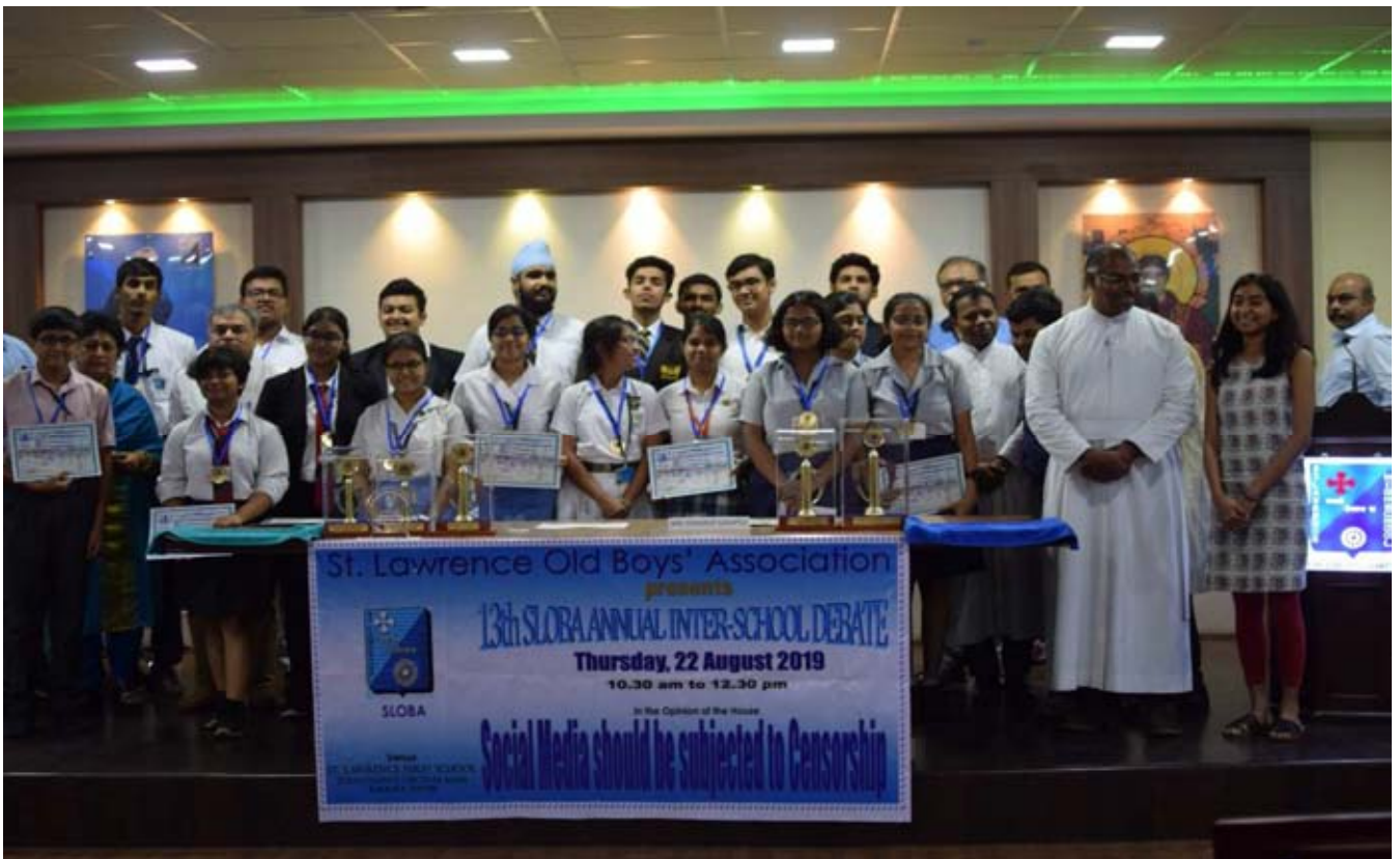
SLOBA Annual Inter-School Debate 2019 Finals