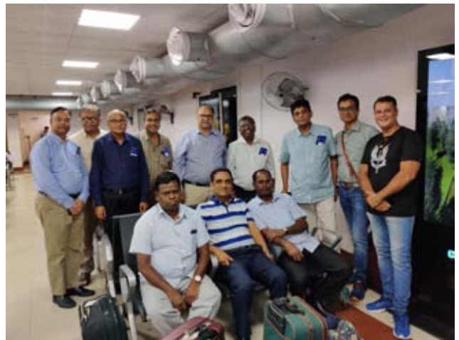
JAAI North Zone Conference Patna 2019