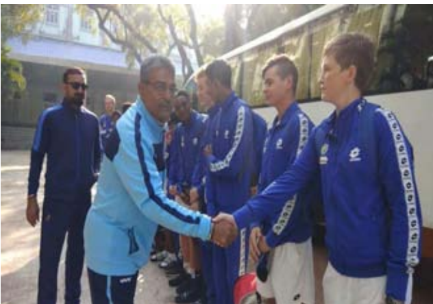
Waterstone College (South Africa) Students Cricket Team at our School