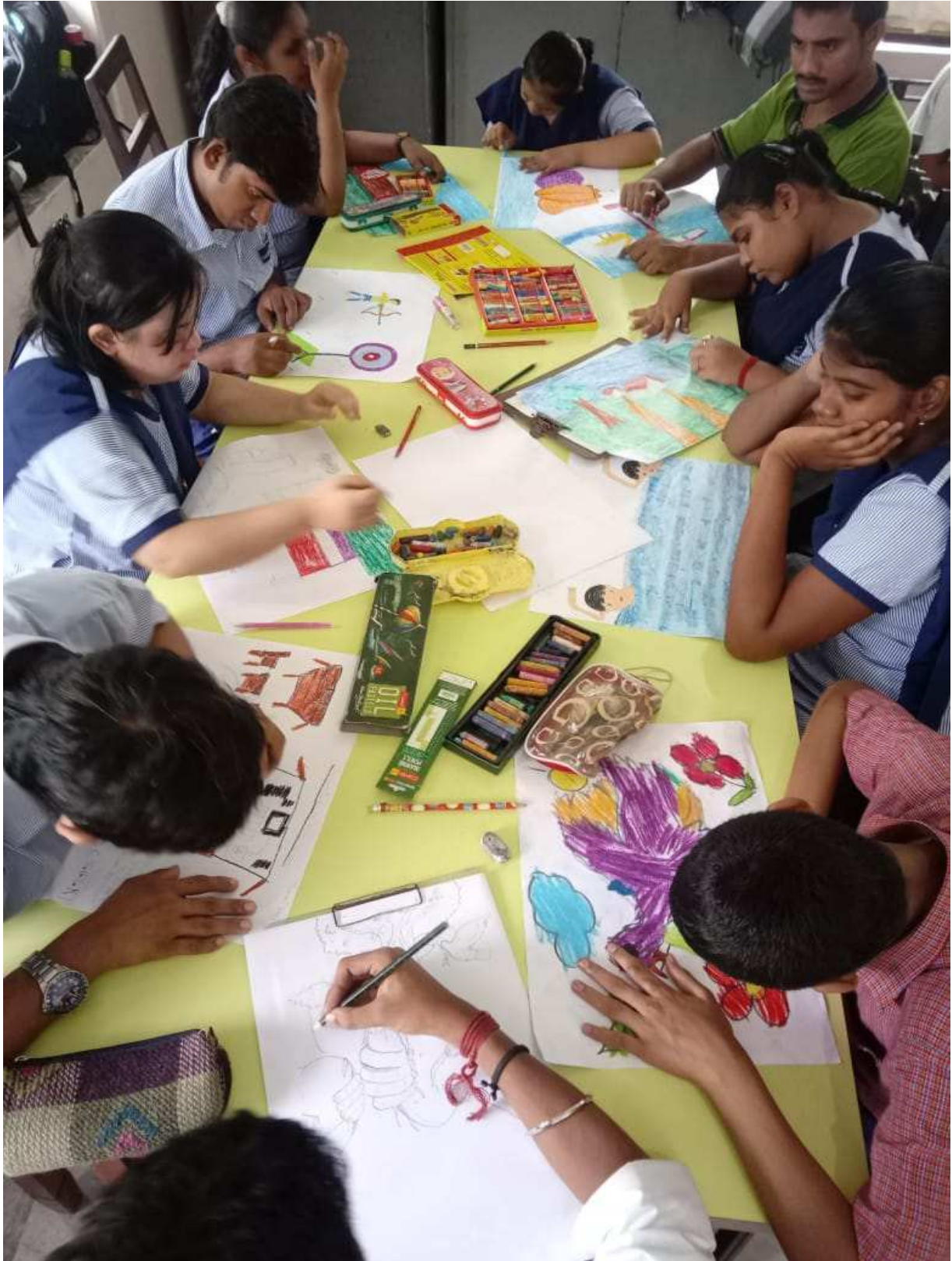
Students of St. Lawrence High School lend empathetic hands at Mentaid