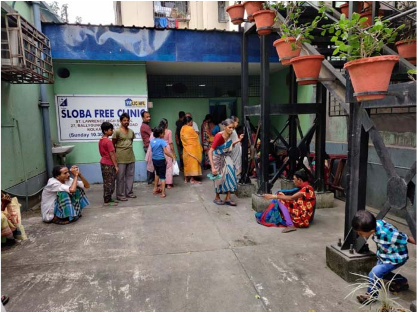
SLOBA Free Clinic in collaboration with LIC Housing Finance Limited