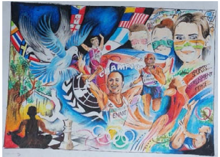
Students' Works from the Global Drawing Competition at Expression 2019