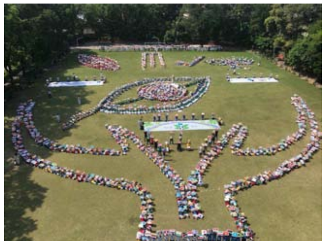
Ensemble 2019 at School