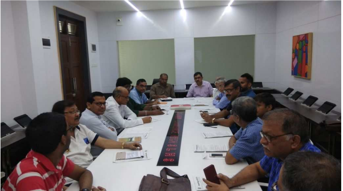
AGM 2018-19 on 29 th September 2019 at APJ Abdul Kalam Hall St. Lawrence High School Kolkata