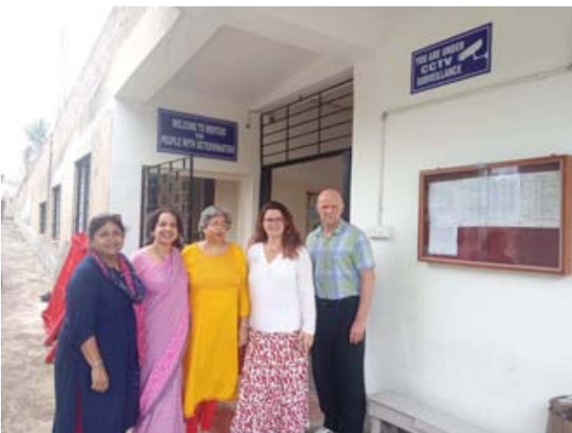
The Expression 2019 Team at Mentaid, Thakurpukur